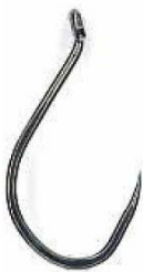
Barbless J hook

Circle hooks differ from conventional J-style hooks in that the hook point is bent back toward the hook shank. This design means that as a fish swims away with the bait in its mouth, the hook doesn't set until it reaches the corner of their mouth, hooking them there rather than in the throat or stomach. The curved-in point also makes it harder for fish to spit the hook, even with barbless circle hooks.