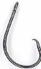
Barbless circle hook