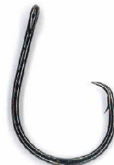
Barbed circle hook

In our experience, circle hooks are ideal for setlines. The best rig we have tested is a 2/0 barbless circle hook on a 40 lb test monofilament leader, tied using a knot such as a perfection loop or rapala knot, which allows the hook to rotate freely when hooking a fish. This rig has high catch rates, consistently catches burbot in the corner of the mouth, and is easy to unhook once you've landed the fish.